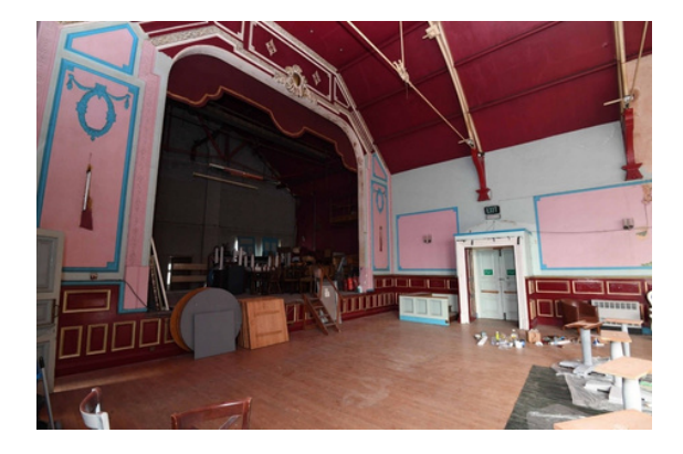
St Georges Hall, Saints Nuneaton

Saints Phase 2 will provide space within the building to offer "Sports & Support" and "Create & Connect" themes, and the refurbishment of the first floor of St Georges Hall. In 2021 TFC was successful in securing a substantial National Lottery Grant (£363K) to support the employment of two development workers for Nuneaton who are now based at Saints. The Phase Two refurbishment of the Saints building has also received a huge boast from the success of Nuneaton and Borough Council securing significant government funding through the Towns Deal. £1.8m has been allocated to the purchase and refurbishment of St. George's Hall.