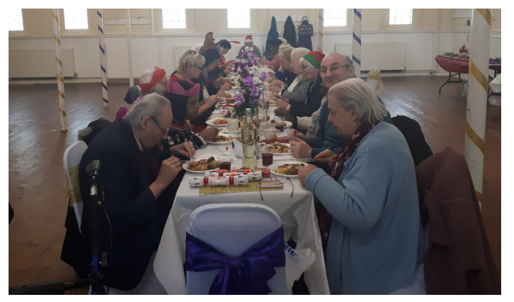
Empowerment Singing and Luncheon Club

In 2021 we connected 609 elderly people to befrienders